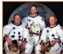
Apollo 11 Astronauts Neil Armstrong Michael Collins Buzz Aldrin